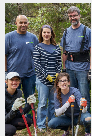
Blackbaud employees volunteering at Blackbaud's Day of Service, 2017 at Walnut Creek Metropolitan Park, Austin, TX

By focusing wholly on this vital and underserved market, Blackbaud has built not just a successful business model, but an innovation engine that has played a role in driving advances on social issues of every kind.