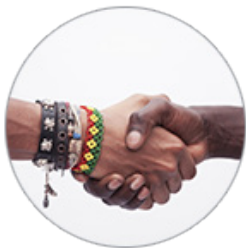
What have they given to us?

Target Analytics utilizes a combination of three data perspectives to inform the modeling effort, including: the supporter giving history recorded by the client, supporter giving to other organizations collected by Target Analytics, and hundreds of wealth and demographic attributes integrated from outside sources. That mix of data assets provides the organization with a holistic view of each supporter, expanding beyond historical relationships, taking into account not only their overall philanthropic tendencies, but also factors such as their life-stage, liquidity, and capacity. The end result of a ProspectPoint engagement is a ranked and prioritized supporter base, recommended treatment for each constituent, well-armed and more confident client, and ultimately, far more effective and efficient fundraising program.