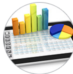
What is their capacity to provide?