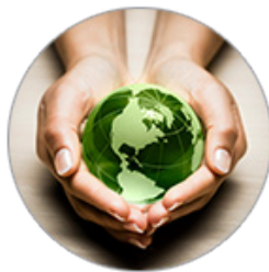
What have they given to others?